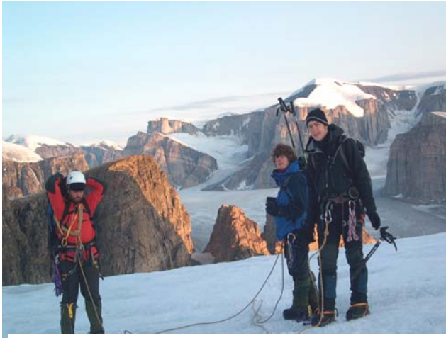
Second Ascent of The Guardian, Milne Land, July 2004

Experience and Explore The vastness and isolation of the Arctic is something that is never forgotten. It touches the very heart – for life. To tread lands previously untrdden is sobering. To have the opportunity of doing this as part of a homogeneous team, where your well-being is dependent upon your fellow traveller, is something very special.