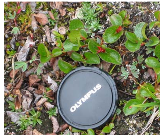
Salix Herbacea - Herblike Willow

In addition , the Expedition is happy to undertake further testing or research as may be requested by its sponsors.