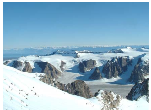
View across Milne Land and Scoresbysund with Knud Rasmussen Land in the far distance

The Group actively promotes the professionalisation of mountaineering skills within Scouting and organises a comprehensive Mountain Leader training programme delivering awards of the Mountain Leader Training Board primarily to Scout and Other Youth Leaders, although the courses are open to all. The personal qualification levels within the Group are high, with an MIC, several Scottish Winter MLAs, and most gaining/working towards higher national and international mountain training awards.